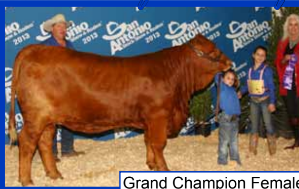
Grand Champion Female