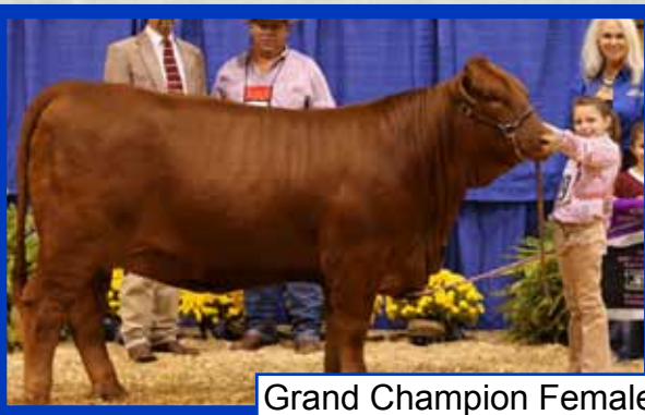
Grand Champion Female