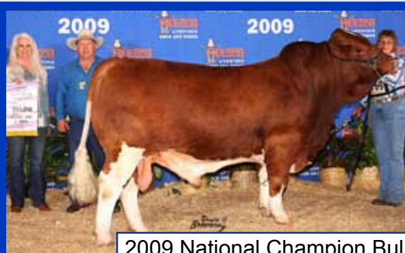
2009 National Champion Bull