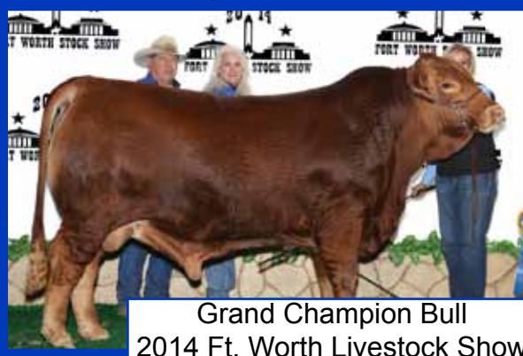
Grand Champion Bull 2014 Ft. Worth Livestock Show